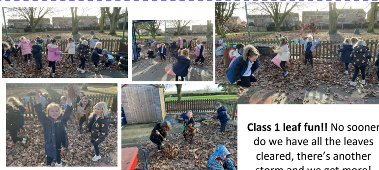
Class 1 leaf fun!! No sooner do we have all the leaves cleared, there's another storm and we get more!

All other coach led clubs remain the same as booked for the whole term. Please do ensure that invoices are settled too.