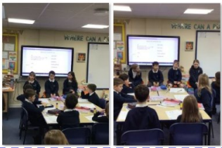
Class 2 have been enjoying their computing learning.