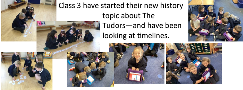
Class 3 have started their new history topic about The Tudors—and have been looking at timelines.