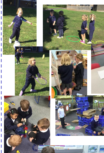
Maths games in Year 2.

They play and learn to negotiate and take turns; write, draw, read, have fun and use both the inside and outside spaces! More pictures on Class 1 page of the website to attempt to demystify school life for you!