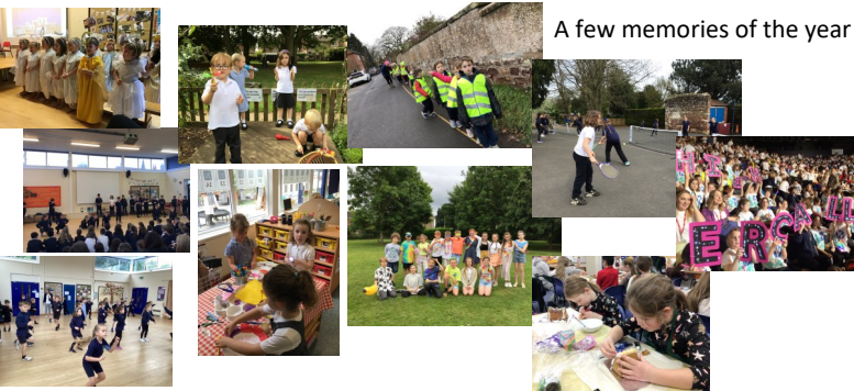
A few memories of the year!

We will see you all on Wednesday 4th September