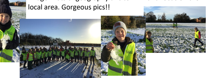
Rodington—Carols by the Tree

Class 2 have had a lovely snowy Geography walk in the village—lots of geography this term with a focus on the