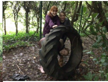
Class 5 forest fun!