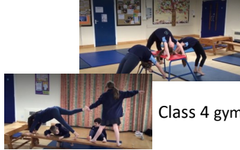
Class 4 gym