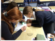
Budding scientists in Class 5— finding out about light and reflectivity.