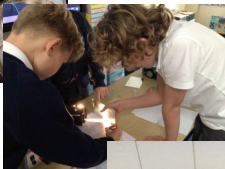
Class 3 have also been investigating light, looking at shadows and making puppets.