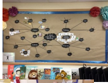
Art in Class 3 this week!