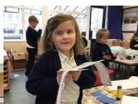
Class 5 landscapes