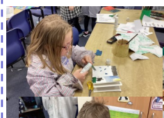
Class 4 mono- prints