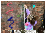
Class 1 have been busy measuring outside.

Lots of lovely activities this week as normal!