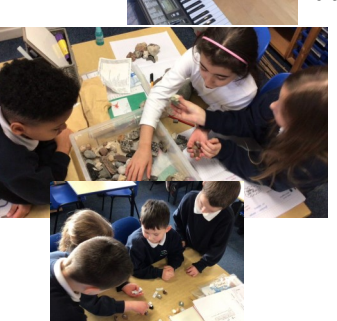
Year 3 have started their new science topic learning about rocks and their properties.